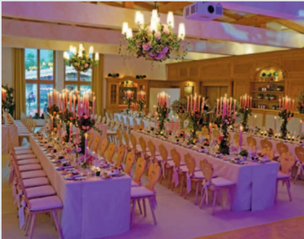
Seating, table decoration, lighting ... we'll be happy to stage your event, too.

The Hermann Reisch Hall also plays an important role during the Hahnenkamm Race: On the Friday and Sunday, the ski racers prepare here between the heats. Marcel Hirscher, Felix Neureuther and others feel just as comfortable here as the ball guests or the seminar participants do. Why is that? It's thanks to the room's homely atmosphere with plenty of wood and an open fireplace.