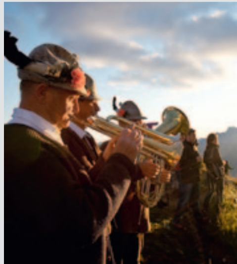
A magical moment: Old melodies are performed by musicians to greet the rising sun.

From the Kitzbüheler Horn, a beautiful hiking route takes you over to the Bichlalm, one of the loveliest hiking areas in our region. This route is also suitable for anyone who is not yet very familiar with the Alpine terrain and who is gaining their first hiking experience. The Bichlalm has been accessible again since 2015 with a double chairlift, on which you can travel back down to the valley in comfort. Of course, this applies in reverse too: You can travel up on