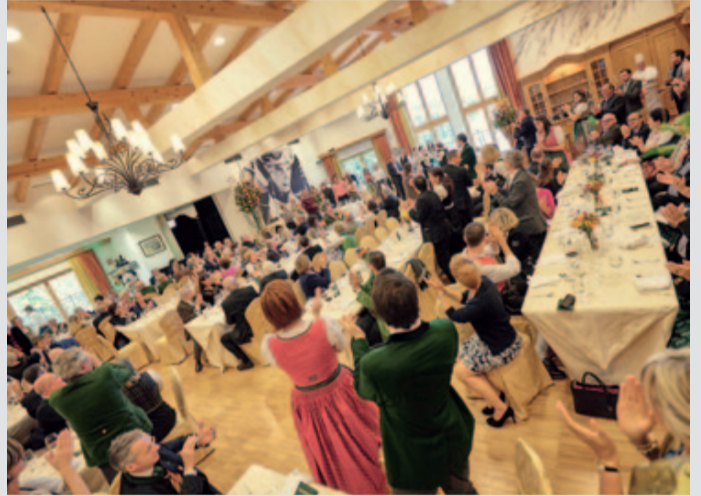
Exuberant parties and celebrations take place time and again in the Hermann Reisch Hall. In the comfortable atmosphere, our guests really feel at home.

The Hermann Reisch Hall has also become an important venue for clubs and associations in the region. They hold their meetings here and – more importantly – their celebrations. Countless balls have already been held here as well: the Farmers' Ball, the Police Ball, the Schützen Ball and many more. Folk dance evenings have also taken place in our hall, as well as concerts, such as the spring concert of Aurach Band, New Year's concerts and many others. We've hosted book presentations, panel discussions, film screenings, award ceremonies, general assemblies and, of course, our annual Alm-SommerParty.